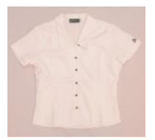
Girls Blouse $60.00