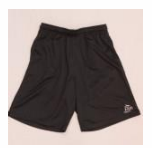
PE Shorts $25.00