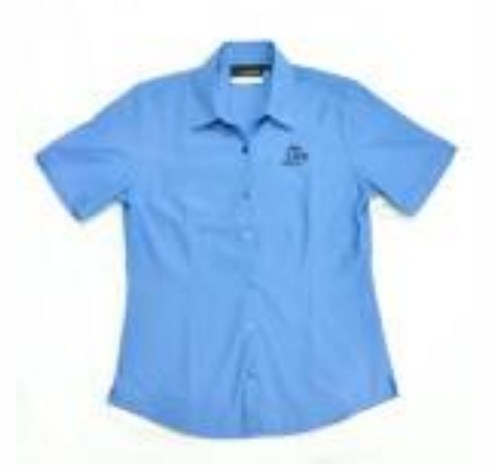
Girls blouse $59.50