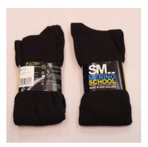
Boys long black socks $15.00