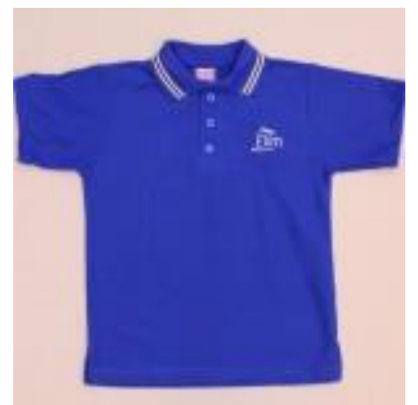
Short Sleeve Polo $37.50