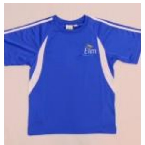
PE Shirt $33.00