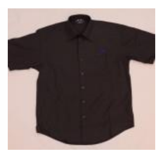
Boys Short Sleeve Shirt $45