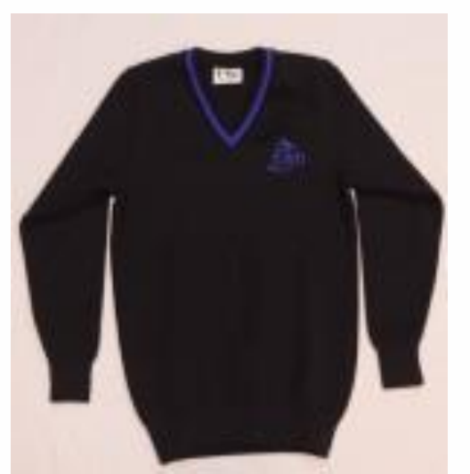
Jumper size 82-92 $103 Size 92+ $113