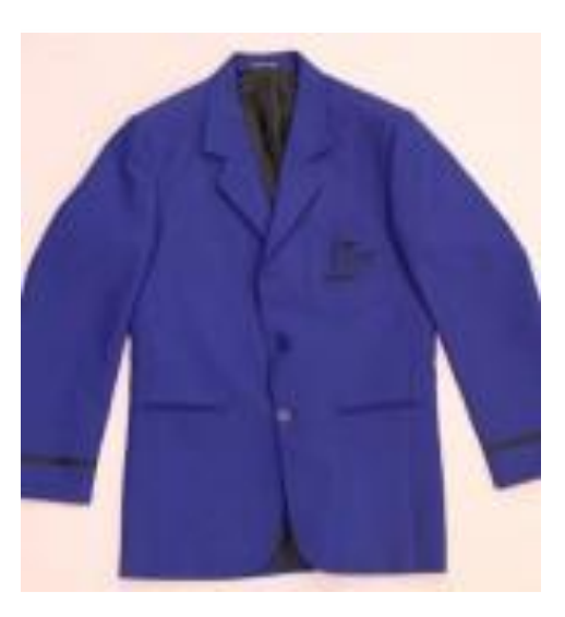
Boys Blazer $250.00