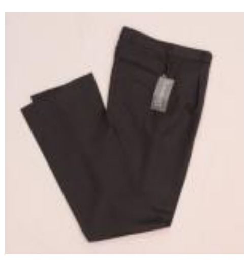
Boys Trousers $70.00