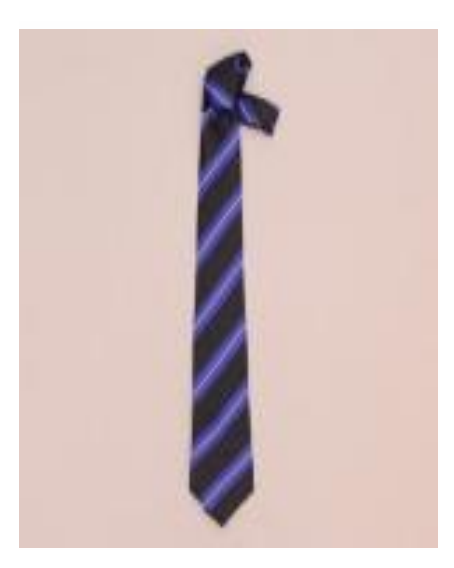
Boys Tie $27.00