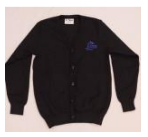
Girls Cardigan $113.00