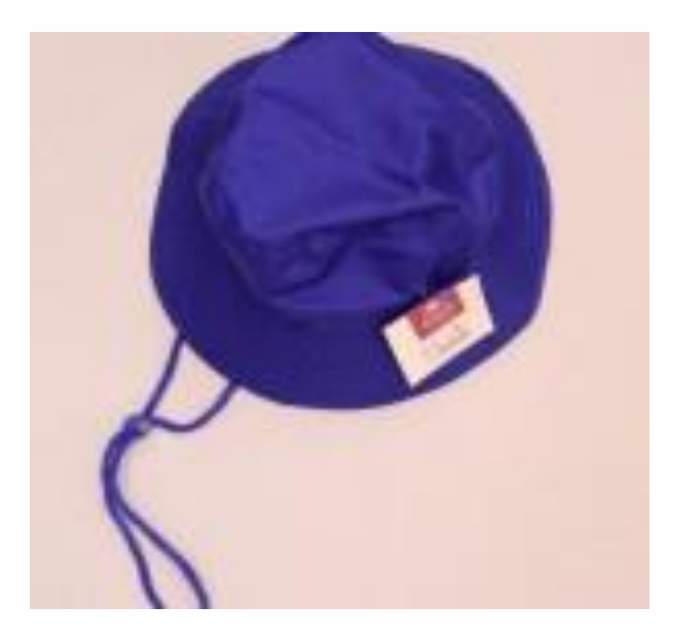
Hat – $16 (Compulsory T1&4)