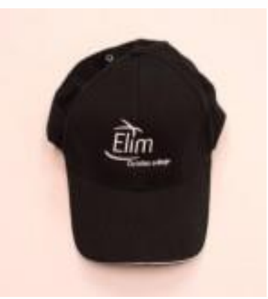
Cap $15.00 (compulsory Term 1 & 4)