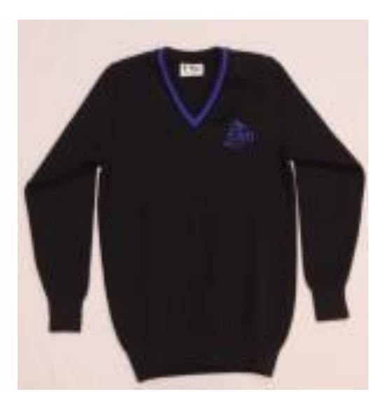
Boys Jumper size 82-92 $103 size 92+ $113