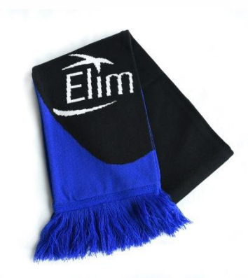
Scarf $42.00 (Term 2 & 3 only)