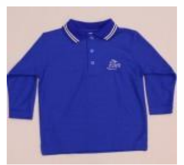
Long Sleeve Polo $40 T2&3 only