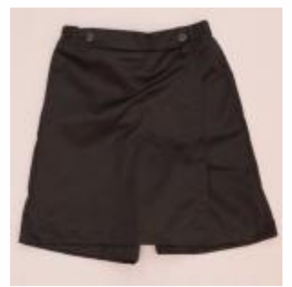
Girls Skort $46.00