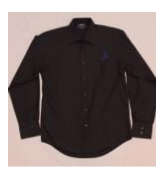
Boys Long Sleeve Shirt $47.50