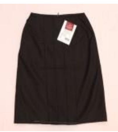
Girls Skirt $62.00