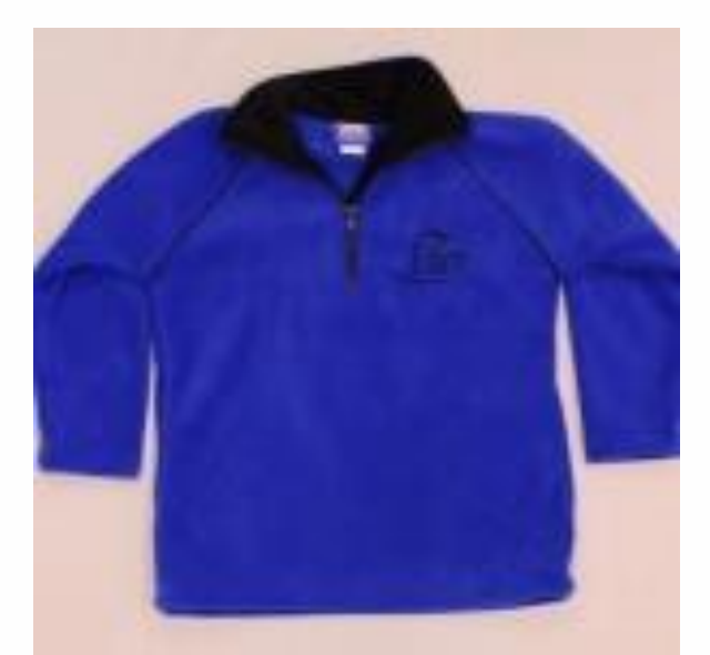
Fleece Sweatshirt $65.00 (half zip only)