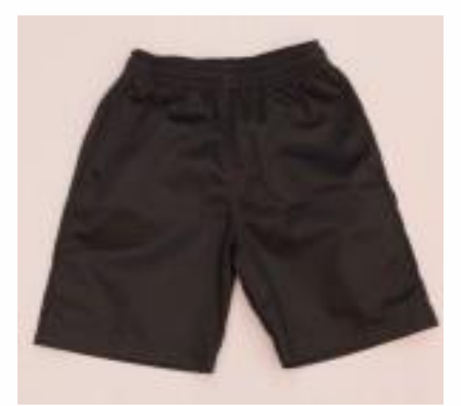
Boys Shorts $46.00