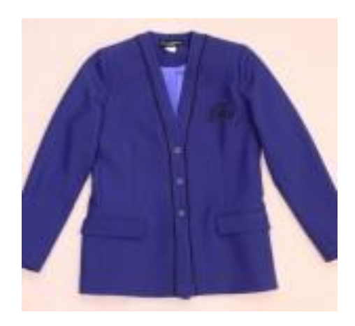
Girls Blazer $250.00