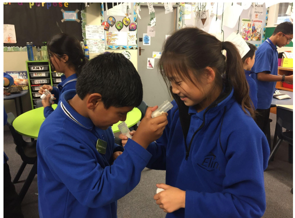
Students learning about plants in Science this week.