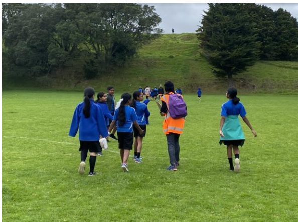
Room 9 and 10 set out to climb to the summit

In week 2, Year 1-6 students visited Owairaka Maunga as part of their Science topic, volcanoes. The students walked to the mountain and spent time exploring the landscape and looking at the Auckland vista from the summit.