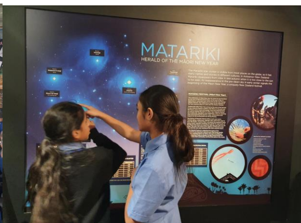
Year 7 and 8 students at the Stardome