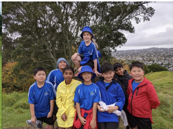
Room 5 students at the summit.

This week Year 7 and 8 students visited Stardome as they broadened their knowledge of Space. This coincided with the opportunity to participate in the national simultaneous Space Station reading by Dr Shannon Walker (PH.D) Nasa Astronaut. This event included over a million students across New Zealand and Australia. Scholastic provided great resources for use in the classroom. It was a great experience encouraging literacy at Elim.