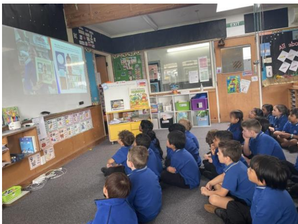
Room 7 and 8 listening to 'Read from Space'

This week Year 7 and 8 students visited Stardome as they broadened their knowledge of Space. This coincided with the opportunity to participate in the national simultaneous Space Station reading by Dr Shannon Walker (PH.D) Nasa Astronaut. This event included over a million students across New Zealand and Australia. Scholastic provided great resources for use in the classroom. It was a great experience encouraging literacy at Elim.