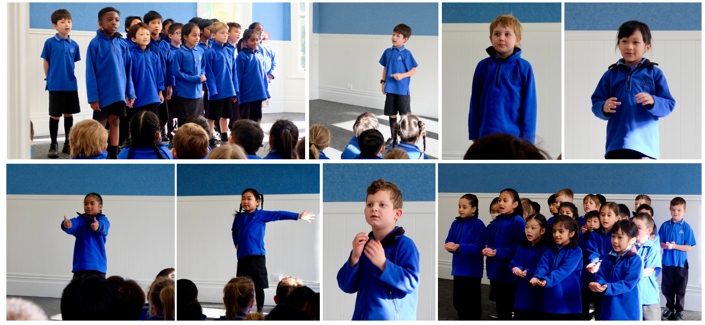
Find more photos from: https://photos.app.goo.gl/u4gQ3HvYAjTnPceF6

Last week the Year 0-3s had a very successful poetry recital! All the children had previously presented a poem to their class. We were really proud of all the children having the confidence and bravery to stand up and present in front of their class. From the class presentations, the teachers selected some students to present their poem at our poetry recital. These students performed excellently and did an amazing job, presenting to the entire Year 0-3 team, as well as teachers and parents. What a fantastic effort!