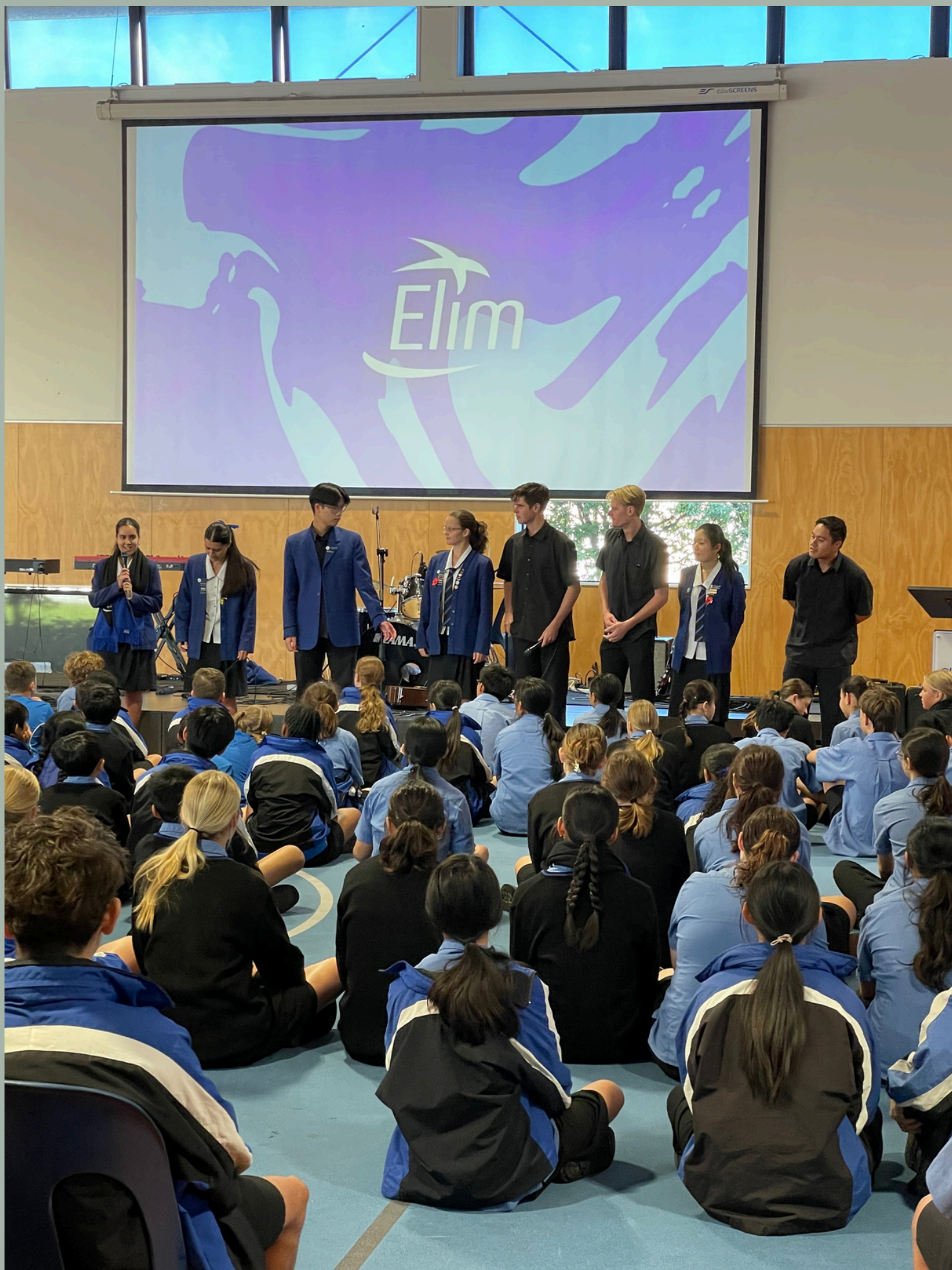
BOTANY CAMPUS PREFECTS AT OUR WEDNESDAY ASSEMBLY