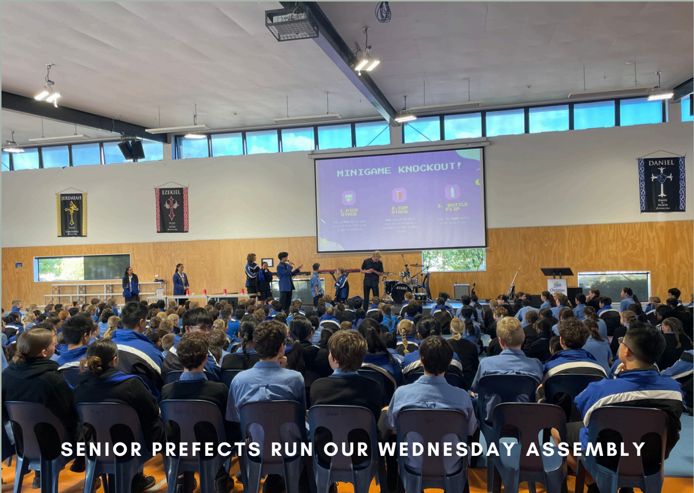
SENIOR PREFECTS RUN OUR WEDNESDAY ASSEMBLY