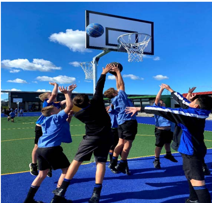
Figure 1 New basketball hoops

The two new multipurpose hoops have been a wonderful new addition to our recreation spaces . It is so good to see our students making the most of the options they have at lunchtime each day.