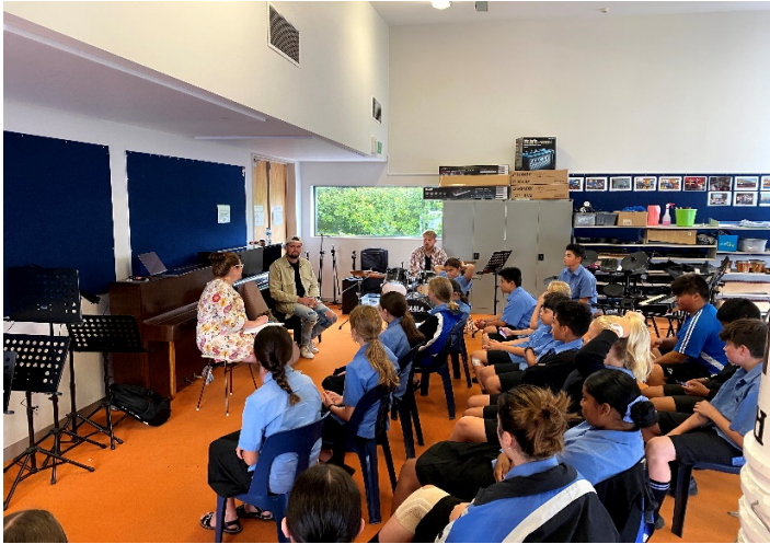
Figure 3 Performing arts