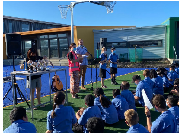
The presentation of last year trophies to our current year 7 and 8's. These were delayed due to COVID restrictions.