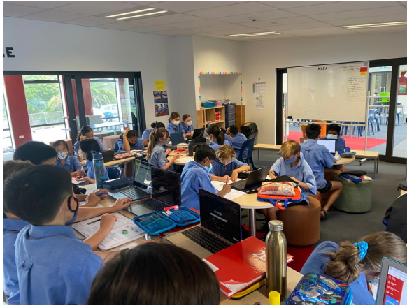
Year 7's in a Maths focus time.