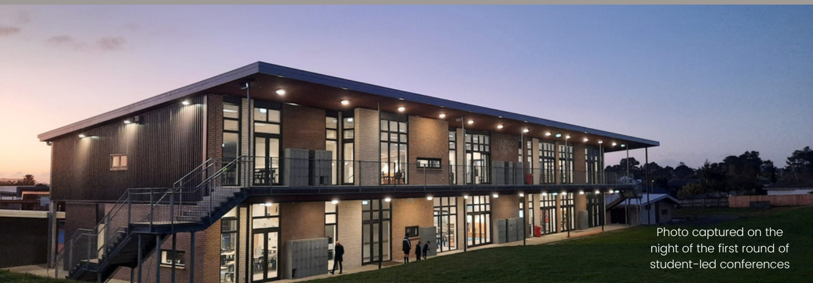
Photo captured on the night of the first round of student-led conferences