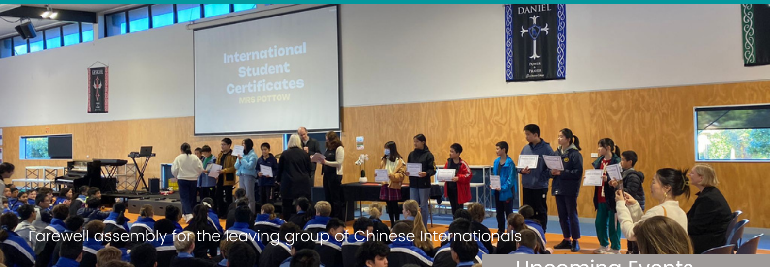
Farewell assembly for the leaving group of Chinese Internationals