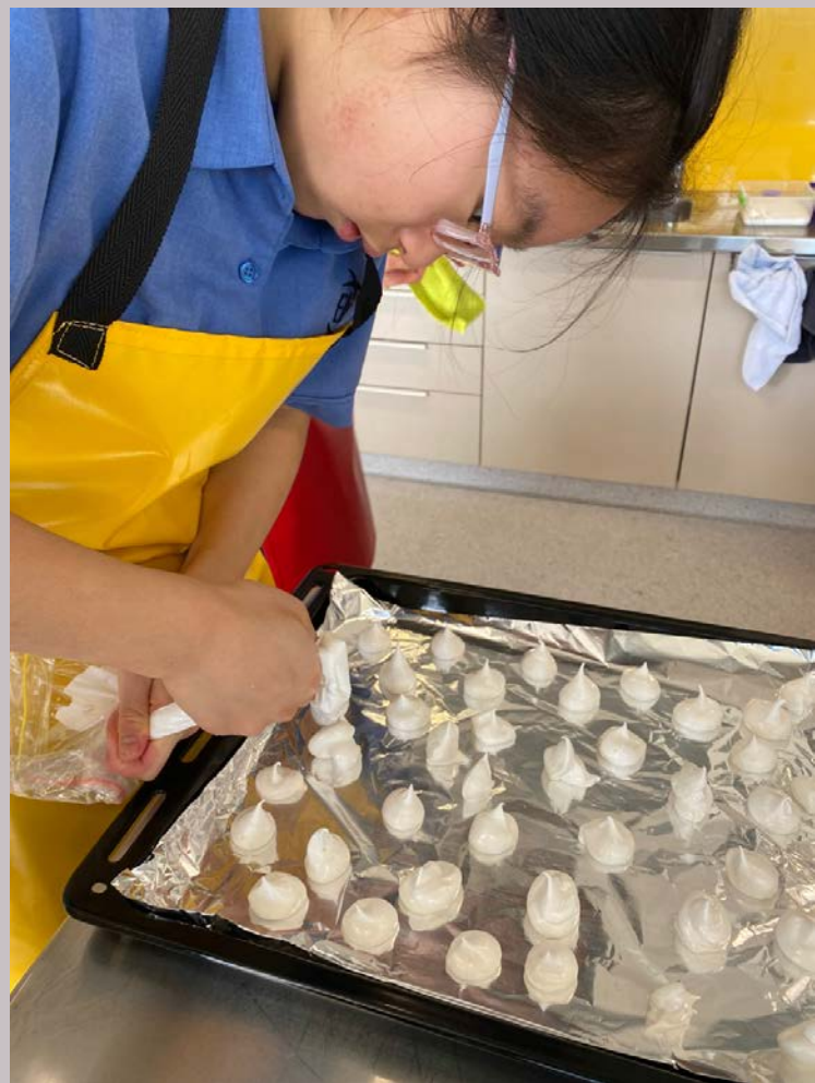
Food technology- a MasterChef timed cooking assessment.