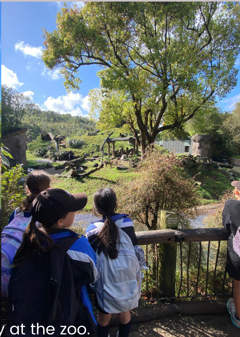
A blessed day at the zoo.