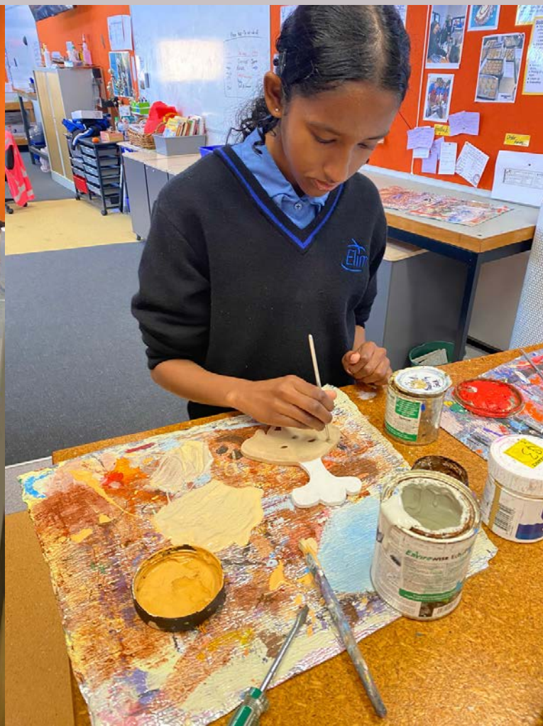
Year 8 students in a Materials processing technology class