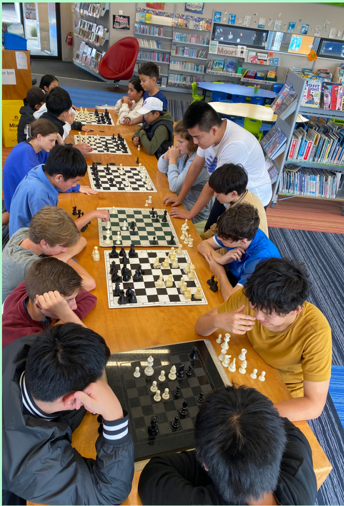
Our chess players are preparing for a cross-campus chess exchange. This is a popular lunchtime activity.