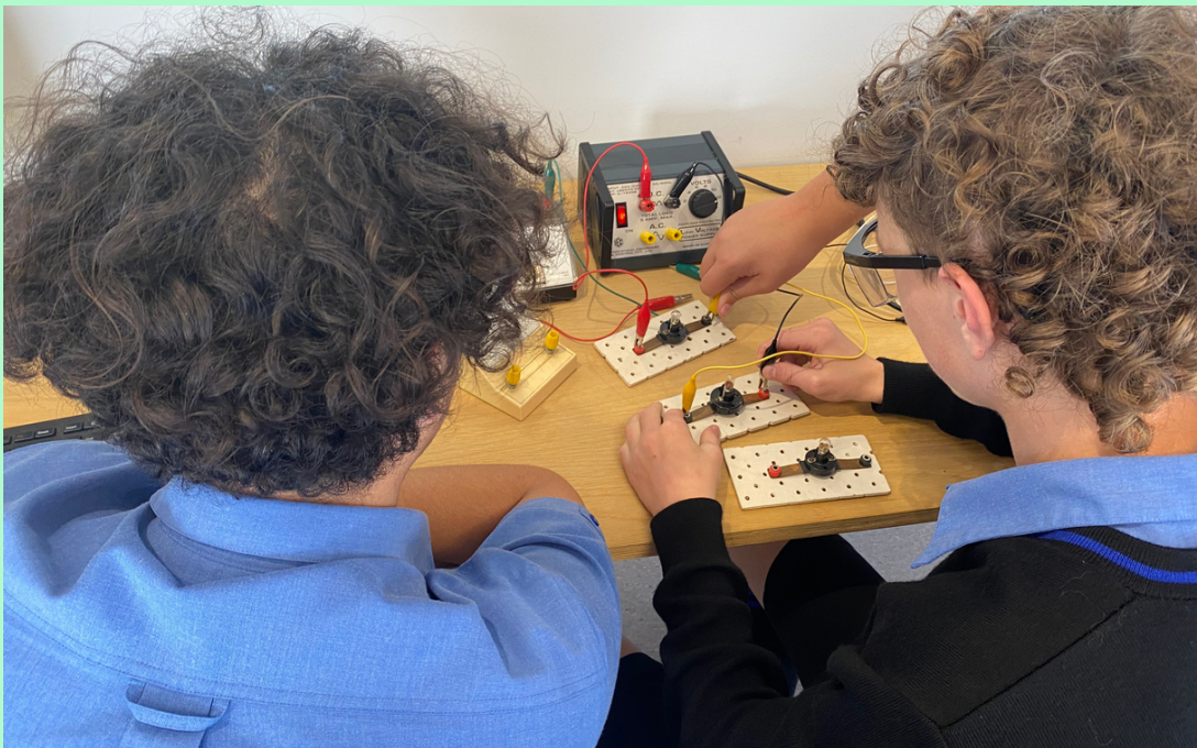
Y10 Science students testing circuits with multimeters