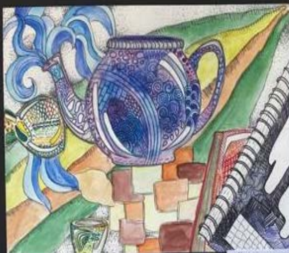
Year 9/10 Art Title: 'Teapot' (2018) Medium: Paper, Colours, Pencils, Markers