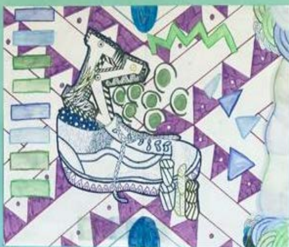
Year 9/10 Art Title: 'Abstract Figure' (2018) Medium: Paper, Colours, Pencils, Markers