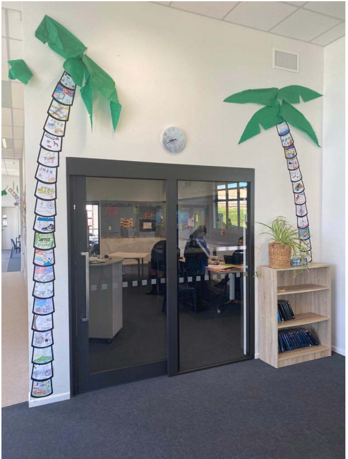
This is part of our Year 9 Whānau spaces Identity Palm.