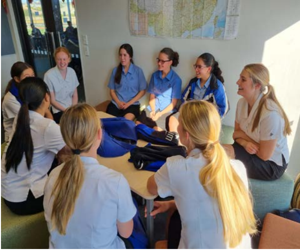
School leaders sharing and having fun and games