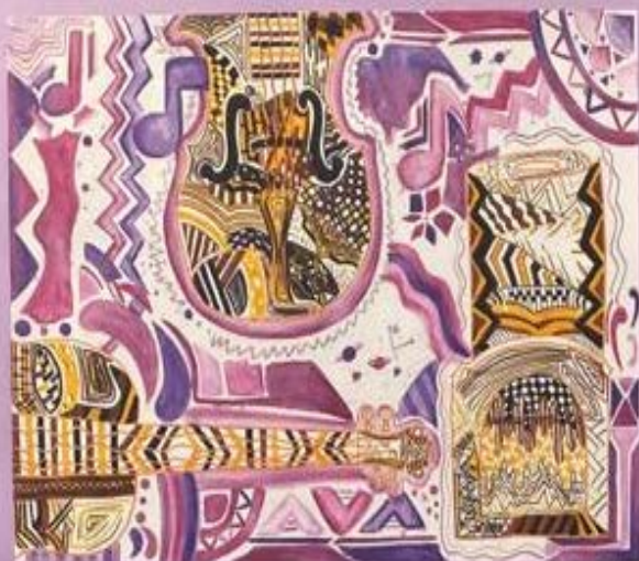
Year 9/10 Art Title: 'African Mask' (2018) Medium: Paper, Colours, Pencils, Markers