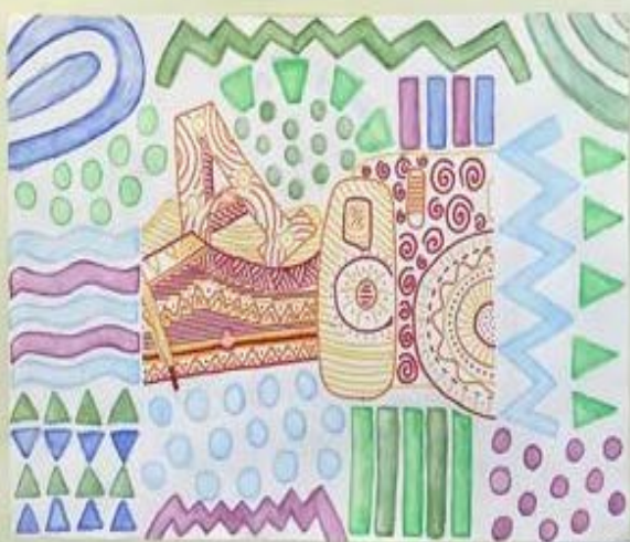
Year 9/10 Art Title: 'African Mask' (2018) Medium: Paper, Colours, Pencils, Markers