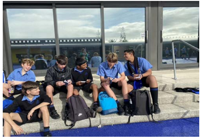
A lovely candid of these Y9 boys reading their bibles at lunchtime.