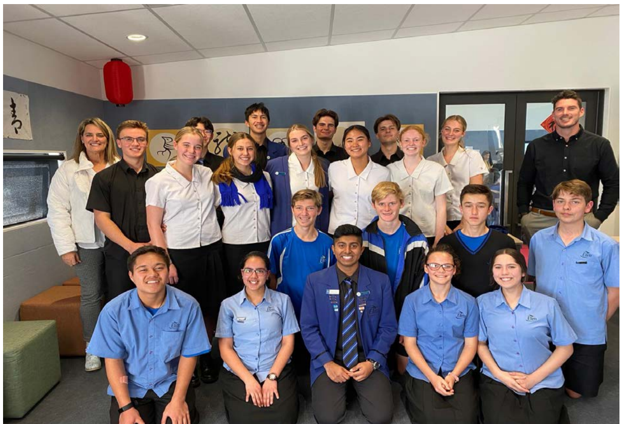
Senior Prefects with Middle Years leaders