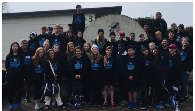
Figure 3 Ready to go home.

Sports camp: On Monday 14 June our Sports Camp team of 37 students left for Totara Springs for a week-long bonanza of participating in different sports. During the week teams might compete in over 30 different sports: Basketball, Croquet, Netball, Petanque, Rugby, Soccer, Softball, Tennis, Touch, Volleyball. We also have some one-off events: Athletics, Cross Country, Frisbee Golf, Hole in one Golf, Kayaking, Swimming and Team Triathlon. One of the highlights of camp is after dinner we keep going with night sports including Bowls, Caged Soccer, Chess, Darts, Draughts, Indoor Hockey and Indoor Soccer. Plus our own unique sports Cheer Night, Scramball, Spikeball and Wallball. Results will be published once the team have returned from camp.