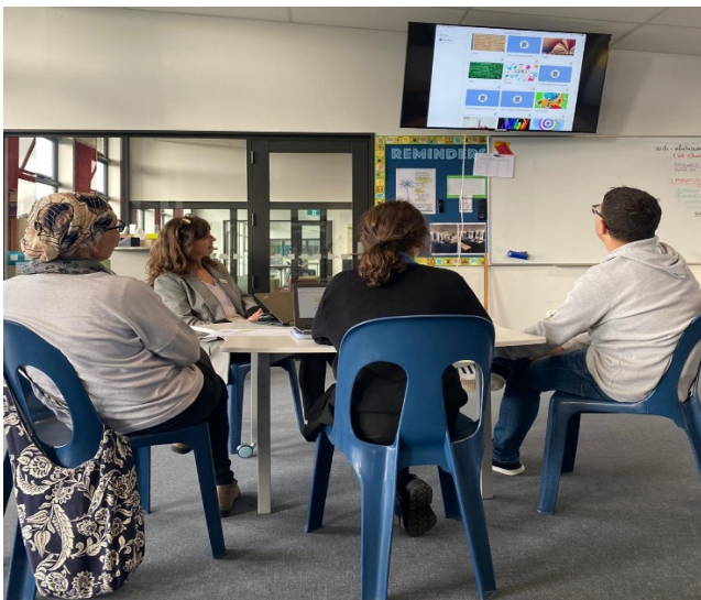
Figure 1 A family hearing about importance of focused learning conversations and a student's learning journey

If you had any specific subject-related questions you wanted to ask, please feel free to directly make contact with the subject teacher. Please allow at least for a 48 hour response time.