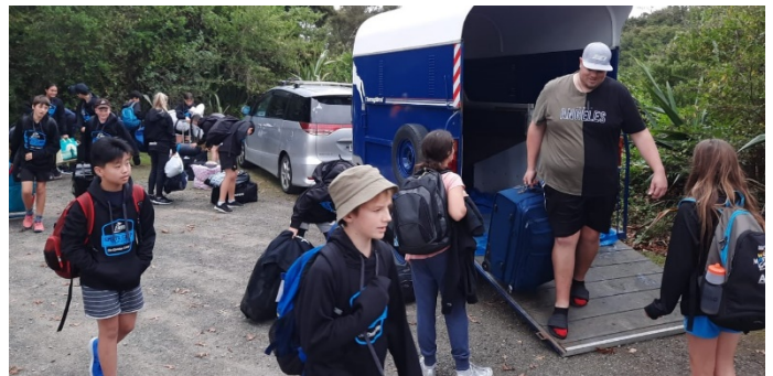
Figure 2 Unpacking and ready to go

https://www.elim.school.nz/curriculum/middle-years-7-10/