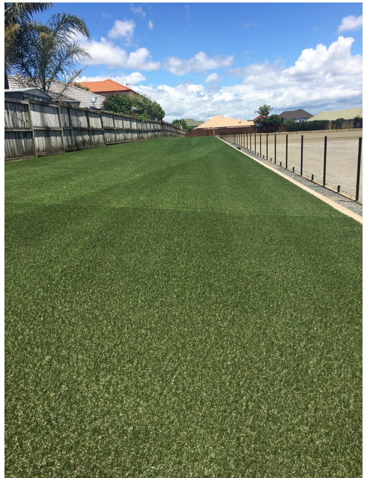
New Turf on Top Bank