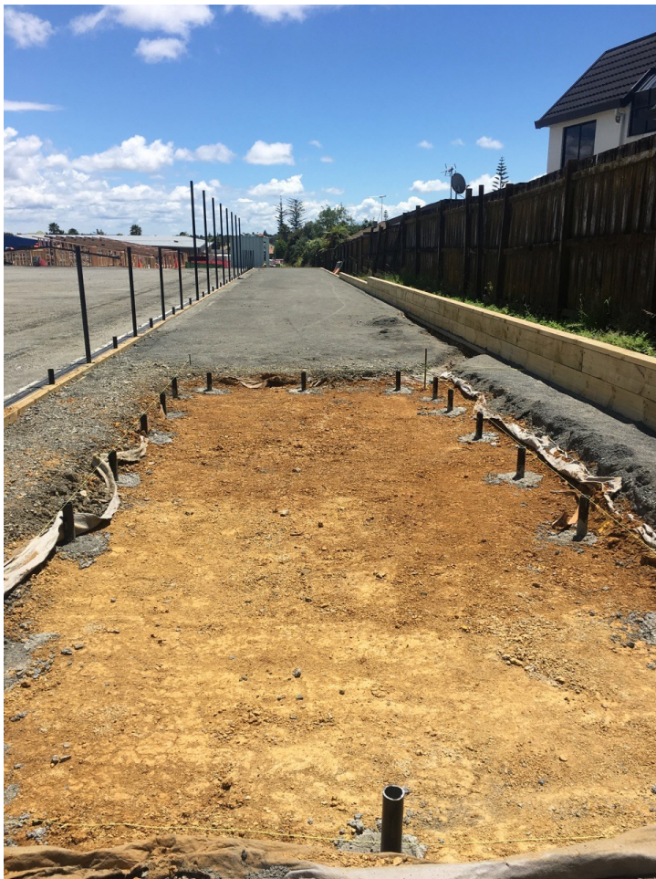
Long Jump Pit