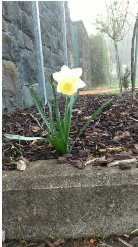
"Spring arrives at our Mt Albert Campus"

Year 6 participating in our "Garden to table" programme. They prepared vegetables, some of which are from the school garden, and made soup. Veggie scraps go into our compost or worm farm.