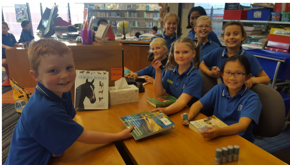
Student librarians at Golflands Campus going about their business.