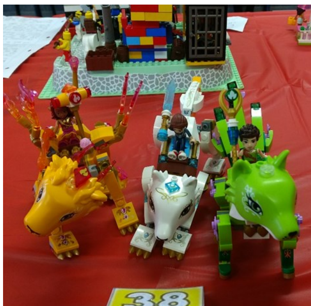
‘LetsGoLego’ at MAC